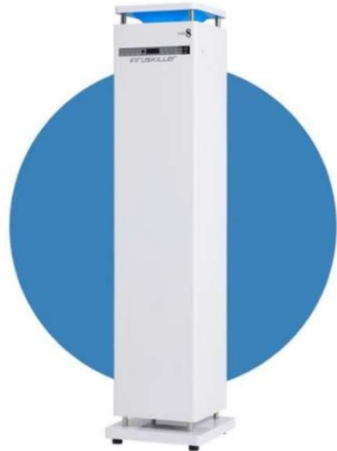
AIR PURIFIER – VIRUSKILLER™ – V103

Plug and Play: Simple operation means out-of-the-box indoor air safety, with no complex installation, setup, or renovation required.