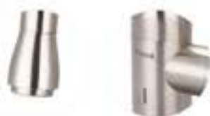
Kitchen series 4 way