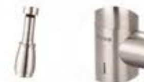
Kitchen series 4 way