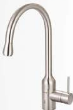
Kitchen series 3 way

Description: Ozone 3 Way Single Lever Kitchen Faucet Model: SKN-O3-01-SN Material: Brass Finishing: Brushed Nickel Cartridge: Ceramic disc cartridge Size of Faucet: 240mm(L)x420(H)xø40±2mm(I.D.) Function: For washing (Ozone cool/warm/hot water)