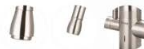
Basin 3 way